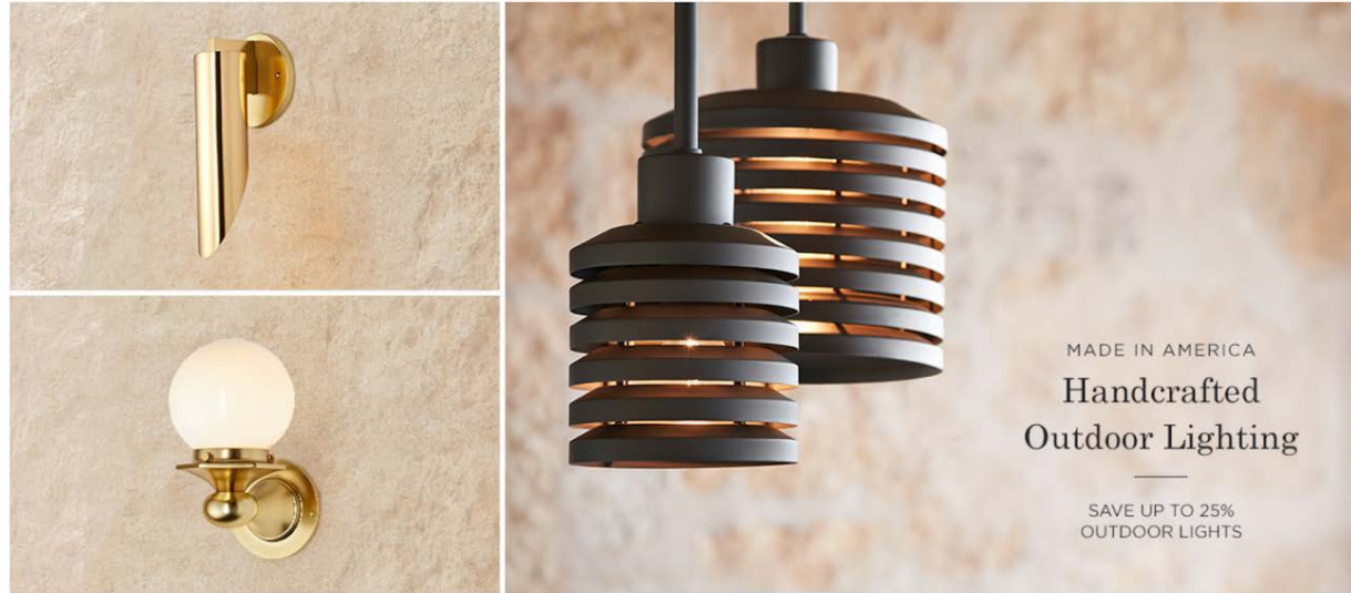
(Company website and emails).

C. Pottery Barn Teen and Pottery Barn Kids-branded upholstered furniture is made in America or in the USA