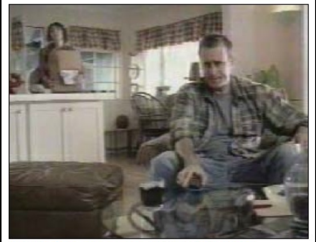
MAN: Hey, honey. WOMAN: Hey. Remember how we talked about eating better?

BUT... potentially deceptive because, as a whole, KFC breasts have more trans fat, more cholesterol, more sodium, and more calories