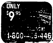
ANNCR: Call 1-800-435-4466 now!