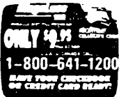
Remember: Have your check book or credit card ready when calling.