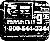
Miracle Trim Diet Pill System for only $9.95.