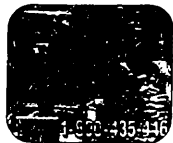
1st WOMAN: Twenty years, twenty cigarettes a day.