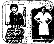
... lost 52 pounds