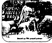
you can burn more body fat relaxing all day than running 10 miles non-stop