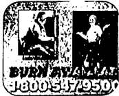
and Annette Garton lost an incredible and amazing 59 pounds!