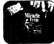
The very first day your powerful new Miracle Trim Diet Pill System