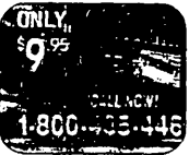
ANNCR: To order Nicotain, call 1-800-435-4466.