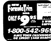
Call 1-800-542-9696 and receive your Swedish Cellulite Cream absolutely free.

ALSO AVAILABLE IN COLOR VIDEO-TAPE CASSETTE