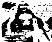
relaxing in the sun then swimming 2 1/2 miles