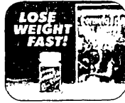
Now you too can lose weight fast.