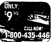
ANNCR: Order Nicotain now. Call 1-800-435-4466.