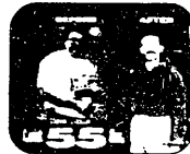
MAN: I quickly lost 55 pounds.