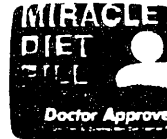
With this doctor approved Mega Loss 1000 Program, you can burn more body fat