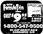
Remember, have your check book