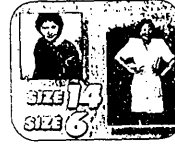
trimming from a size 14 to a size 6.