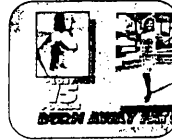
Terry Nigelson burned away 15 pounds.