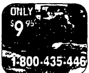
3rd WOMAN: You know you have to quit. So make the call.

ALSO AVAILABLE IN COLOR VIDEO-TAPE CASSETTE This Radio-TV Report contains no offers for services or products. It is not intended to be used for advertising purposes. It may not be reproduced, used in books, newspapers or other publications without the express written permission of the copyright owner.