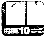
You can rapidly shrink up to 10 inches off your thighs.