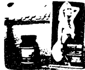
Mega Loss 1000 Miracle Diet Pill Program for only $9.95.