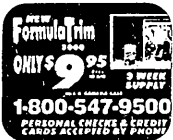
for only $9.95. We accept personal check and credit card orders by phone.