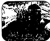
then sweating through five exhausting hours of aerobics.