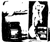
with the powerful, doctor approved.