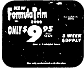
Now you can