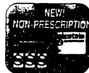
non-prescription Nicotain Stop Smoking Patch. Program is so effective, you can easily quit.