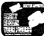
so you can easily regain your youthful figure.