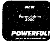
with the help of this new powerful medically-proven FormulaTrim 3000 No Hunger Diet Pill.