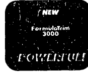
with the help of this new powerful FormulaTrim 3000 diet pill.