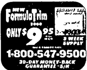
Your satisfaction is 100% guaranteed.