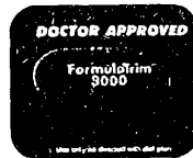
doctor-approved diet pill formula is medically proven to work.