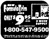
For only $9.95. Call right now