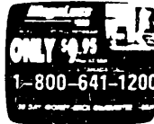
We accept all personal checks and credit card orders by phone.