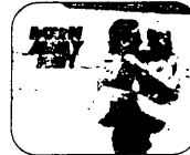
Following this new powerful FormulaTrim fat burning diet plan.