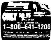
Your satisfaction is 100% guaranteed.