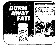
The new FormulaTrim fat burning plan is so powerful.