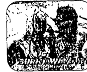
you can burn more body fat relaxing all day

ALSO AVAILABLE IN COLOR VIDEO-TAPE CASSETTE