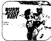
FormulaTrim's new fat-burning plan is