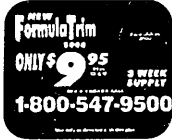
burn away fat and lose weight fast by calling 1-800-547-9500