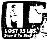
rapidly dropping from a size 8 to a size 4