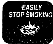
(MUSIC) ANNCR: You can easily stop smoking with the new non-medicated,