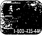
ROXANNA: And I quit in just one week.