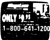
for only $9.95.