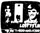
carving 10 bulging inches from his waist