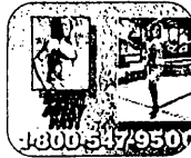
burned away 15 pounds;