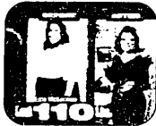
2nd ANNCR: Now it's your turn to dramatically reshape your figure