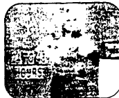
in 24 to 48 hours.