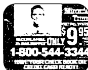
2nd ANNCR: Have your check book or credit card ready when calling. That's 1-800-544-3344, call now. (MUSIC OUT)

ALSO AVAILABLE IN COLOR VIDEO-TAPE CASSETTE