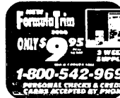
for your powerful FormulaTrim 3000 for only $9.95. We accept personal check and credit card orders by phone.