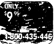
So don't wait. Make the call. Make the call now.