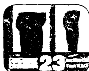
and you can quickly shrink up to an amazing 23 inches from your waist.