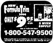
Call 1-800-547-9500 now to order your three week supply.