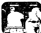
WOMAN: Thanks to Miracle Trim I'm enjoying my new body.