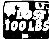
and E.J. Elkar lost an incredible