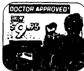
This revolutionary new behavior modification,