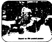
you can burn more body fat relaxing all day