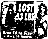
ANNCR: Toronto's Debbie Holloway lost 53 pounds trimming from a size 16 to a size 7.