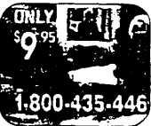
2nd WOMAN: I called, I quit, and it only cost $9.95.