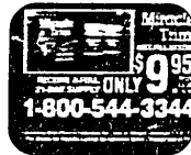
by calling 1-800-544-3344 for your new