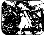
than running 10 miles non-stop