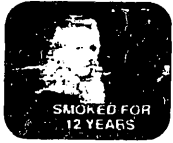
whether you smoke one, two, even three packs a day. Roxanna Sales smoked for 12 years.