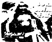
or exercising 6 hours nonstop