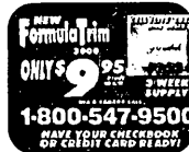
that's 1-800-547-9500. Call now!

ALSO AVAILABLE IN COLOR VIDEO-TAPE CASSETTE