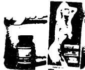
(MUSIC) ANNCR: You can start losing up to 10, 20, 50 even 100 pounds