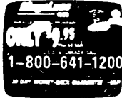
for your doctor approved Mega Loss 1000 Miracle Diet Pill Program.