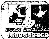
and Annette Barton burned away an incredible and amazing 59 pounds! (MUSIC OUT)