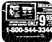
Miracle Trim for only $9.95