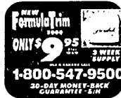
and receive your Swedish Cellulite Creme absolutely free.