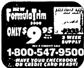
or credit card ready when calling.