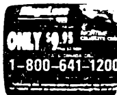
your Nighttime Cellulite Cream absolutely free.