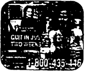
and I quit in just two weeks with Nicotain. (MUSIC OUT)