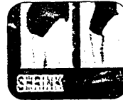
You can easily shrink as much as 20 inches from your hips