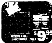
You can start losing up to 10, 20, 50,