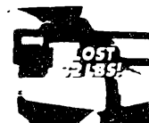
quickly lost 32 pounds

ALSO AVAILABLE IN COLOR VIDEO-TAPE CASSETTE