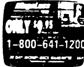
for only $9.95.