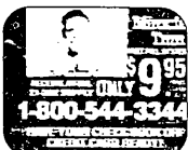
personal weight loss consultation, absolutely free.