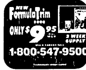
for your powerful new FormulaTrim 3000