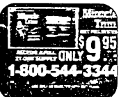
and we'll give you this free supply to complete your 21 day system.