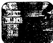
and begin regaining your youthful figure