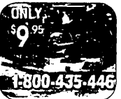
MAN: Every cigarette brings you seven minutes closer to death.