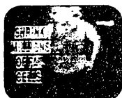
(MUSIC) ANNCR: Now you can start shrinking millions of fat cells