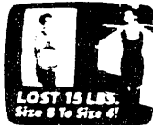
Ohio's Faye Diamond lost a dramatic 15 pounds.