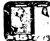
large size 15 to a slim 7.

ALSO AVAILABLE IN COLOR VIDEO-TAPE CASSETTE