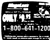
Call right now and receive