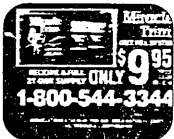
Call 1-800-544-3344 to order your new