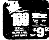
This new Miracle Trim Diet Pill System