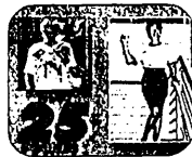
(MUSIC) MALE ANNCR: Debbie Hoya lost 25 pounds fast.