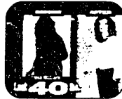
finally found one that really worked.