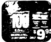
even a typical 100 pounds for only $9.95.