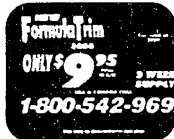
ANNCR: Now you can end biting hunger pain, burn away fat and lose weight fast by calling 1-800-542-9696