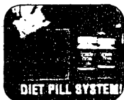
attacks years of built up fat.