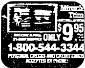
We accept all personal checks and credit card orders by phone.