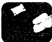
is doctor approved to help you quickly shrink millions of fat cells