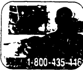
MAN: Nicotain made it easy. And I didn't have to go to a doctor for it.