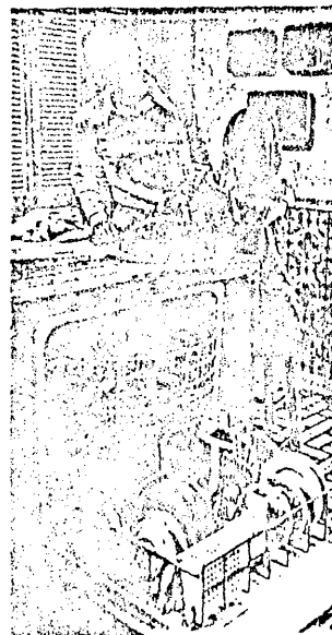
Demonstration courtesy of National Consumer Testing Institute

Now all you have to do to dishes before you load them is pick them up from the table (and remove