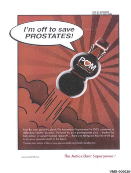
Figure 1 Challenged Ad (CX0274).

(CCFF 585). As evidenced in the chart above, any comparisons between the Bovitz Stimuli and the Challenged Ad with the same headline is completely irrelevant because the Challenged Ads with the same headlines <u>all have body copy</u>, and the body copy of an ad drastically changes the meaning of an ad or what a reasonable person would take away from it. (RRFF 584). Indeed, a simple facial comparison of the "I'm off to save PROSTATES!" Bovitz Stimuli to the "I'm off to save PROSTATES!" Challenged Ad (print ad version), both of which are depicted below in Figures 1 and 2, respectively, aptly illustrates this obvious point.