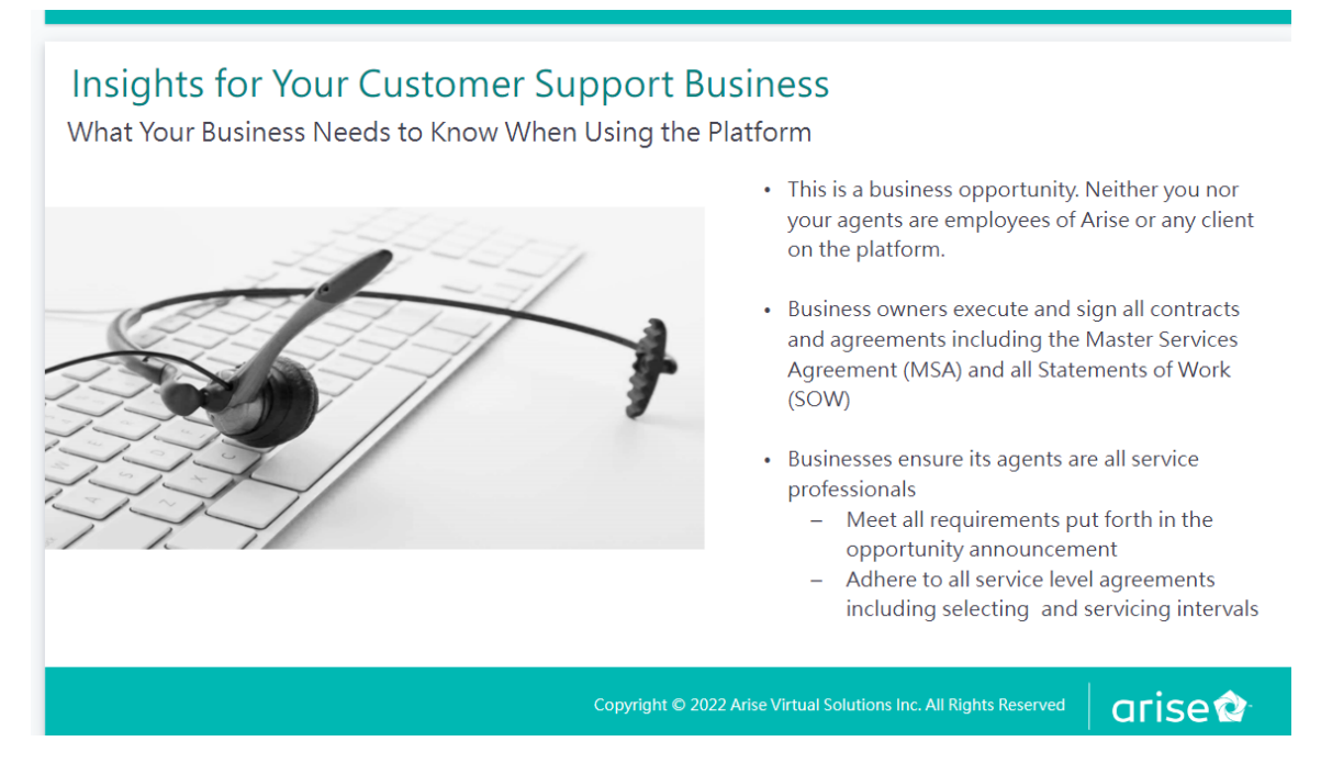
Figure 6. Arise Ad Contrasting Business Opportunity with Employment.

41. Defendant has known about the Business Opportunity Rule and the obligations it imposes. Even the Commission's Civil Investigative Demand, which was served on Defendant in April 2022, named the Business Opportunity Rule as a focus of the FTC's investigation and attached an official copy of the Rule.