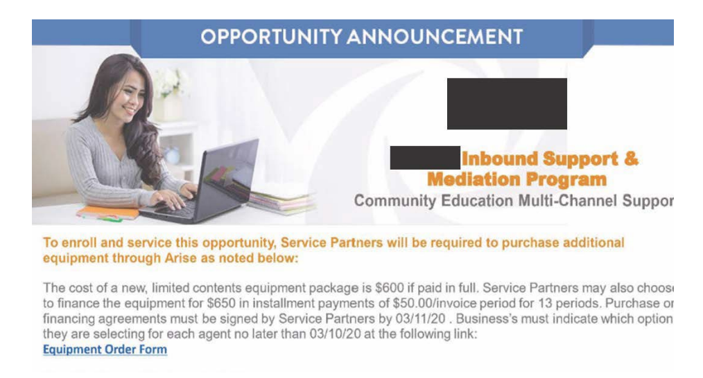
Figure 5. Additional Equipment Required by Arise.

34. Many of Defendant's corporate clients also require agents to purchase additional equipment for their particular work opportunity, such as a second monitor, hard-wired telephone service, or even a special computer sold and financed by Defendant, as shown below in Figure 5.