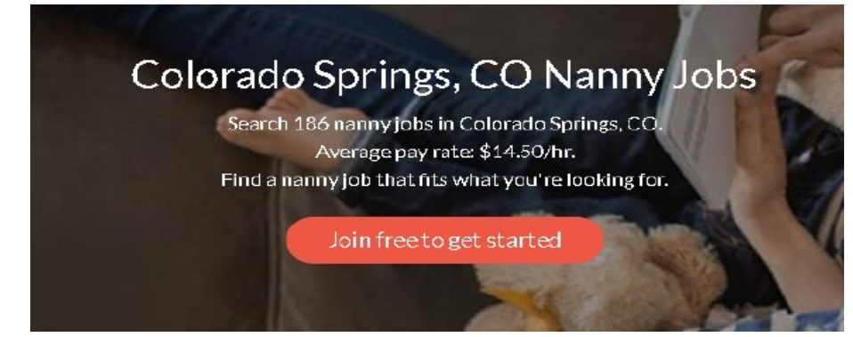
Figure 1: Exemplar of a local landing page.

26. At the top of its local landing pages, which are tailored to specific geographic regions, Care claims that a specific number of the relevant types of job postings in that specific geographic region are available on its platform at that point in time, such as "Search 186 nanny jobs in Colorado Springs, CO." An example of this display is shown in Figure 1 .